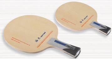
NO.145 日本栓木面材，金黄黑碳纤维，柳木大芯五层芳碳结构 Material: Surface:Japanese Hinoki Fiber Force:Gold and balck Carbon Core:Candlenut Number of plywood:5 Thickness:7.0±0.2mm Weight: 95±3gms