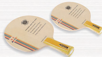
NO.99 面材榆木,力材云杉,第三层阿尤斯,桐木大芯,七层纯木板 Material: Surface: Hinoki Force: Spruce+Ayous Core:Candlenut Number of plywood:7 Thickness:6.8±0.2mm Weight:85±3gms