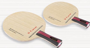
NO.123 林巴面材，林巴力材，桐木大芯，五层纯木 Material: Surface:Limba Force:Limba Core:Candlenut Number of plywood:5 Thickness:5.8±0.2mm Weight:78±3gms