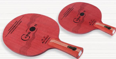
NO.93 面材染色大红KOTO,力材染黑阿尤斯，三层染色大红KOTO, 中间夹碳，六木一碳结构 Material: Surface: KOTO Force: KOTO Core:Carbon

Number of plywood:7 Thickness:5.6±0.2mm Weight:94±3gms