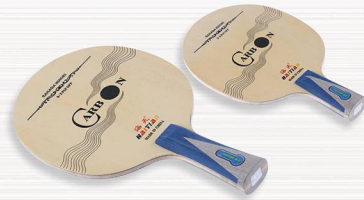
NO13 桧木面材, 碳纤维力材, 桐木大芯, 五层碳板 Material: Surface: Hinoki Force: Carbon Core: Candlenut Number of plywood: 5 Thickness: 6.2±0.2mm Weight: 86±3gms