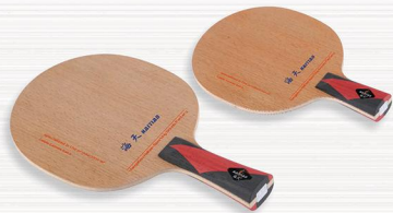
NO.153 红榉木面材, 云杉力材, 阿尤斯大芯, 五层纯木结构 Material: Surface:Red beech wood Force:Spruce wood Core:Ayous Number of plywood:5 Thickness:5.8±0.2mm Weight: 84±3gms