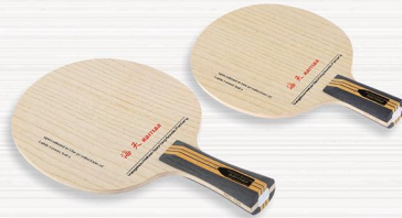
NO.124 白蜡木面材，白蜡木力材，阿尤斯大芯，五层纯木 Material: Surface:ASH Wood Force:ASH Wood Core:Ayous Number of plywood:5 Thickness:5.5±0.2mm Weight:78±3gms