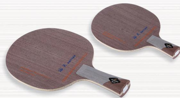
NO.149 KOTO面材(咖啡色)，金黄黑碳纤维，阿尤斯力材，阿尤斯大芯七层芳碳结构 Material: Surface:KOTO(coffee) Force:Ayous Core: Ayous Number of plywood:7 Thickness:6.0±0.2mm Weight: 85±3gms