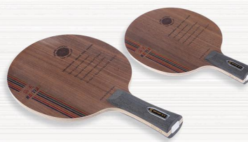
NO.23 黑胡桃面材, 中间三层阿尤斯夹两层黑胡桃, 七层纯木 Material: Surface:Walnut Number of plywood:7 Force:Walnut Thickness:6.3±0.2mm Core:Ayous Weight:89±3gms