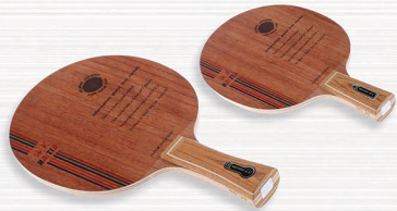
NO.33 红玫瑰木面材，中间三层阿尤斯，两层红玫瑰，七层纯木 Material: Red Rose wood Surface: Red Rose wood Force: Red Rosewood Core: Ayous Number of plywood: 7 Thickness: 6.5±0.2mm Weight: 86±3gms