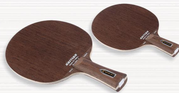
NO:173 鸡翅木面材, 阿尤斯力材, 桐木大芯, 二层ZLC灰黑芳纶纤维靠大芯两侧 五木二碳 Material: Surface: Wenge Force: Ayous, Grey and black Carbon fiber Core: Candlenut Number of plywood:7 Thickness:6.0±0.2mm Weight:95±3gms