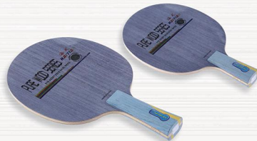
NO.7 染色KOTO面材，云杉力材，阿尤斯大芯，五层纯木 Material: Number of plywood:7 Surface: KOTO Thickness:6.0±0.2mm Force:Spruce Weight:84±3gms Core:Ayous