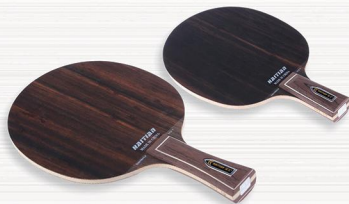
NO.19 黑檀面材, 云杉力材, 阿尤斯大芯, 五层纯木 Material: Surface:Ebenholz Number of plywood:5 Force:Spruce Thickness:6.0±0.2mm Core:Ayous Weight:85±3gms