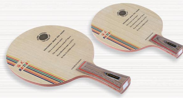
NO16 林巴面材, 中间五层阿尤斯, 七层纯木 Material: Surface: Limba Force: Ayous Number of plywood: 7 Thickness: 6.4±0.2mm Weight: 86±3gms