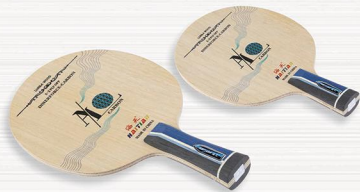
NO:171 林巴面材, 阿尤斯力材, 阿尤斯大芯, 二层ALC蓝黑芳纶纤维靠大芯两侧 五木二碳 Material: Surface: Limba Force: Ayous, blue and black Carbon Fiber Core: Ayous Number of plywood:7 Thickness:6.0±0.2mm Weight:90±3gms