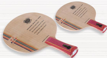
NO.30 枫木面材，阿尤斯力材，二层顺丝云杉，阿尤斯大芯，七层纯木 Material: Maple wood Surface:Maple wood Force:Ayous+3layers of Spruce Core:Ayous Number of plywood:7 Thickness:6.2±0.2mm Weight:87±3gms