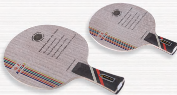
NO.98 面材染色咖啡KOTO,力材云杉,第三层染色咖啡KOTO,桐木大芯,七层纯木板 Material: Surface: KOTO Force: Spruce + KOTO Core:Candlenut Number of plywood:7 Thickness:5.7±0.2mm Weight:80±3gms