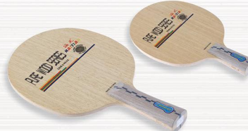
NO.6 林巴面材，阿尤斯力材，加厚桐木大芯，五层纯木 Material: Number of plywood:5 Surface:Limba Thickness:6.5±0.2mm Force:Ayous Weight:85±3gms Core: Candlenut