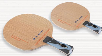
NO.147 云杉面材，蓝黑碳纤维，阿尤斯力材，桐木大芯七层芳碳结构 Material: Surface:Spruce wood Force:Ayous Core:Candlenut Number of plywood:7 Thickness:6.0±0.2mm Weight: 85±3gms