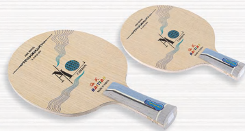
NO.102 面材白蜡木,夹二层蓝黑芳基纤维,第三层阿尤斯,桐木大芯,五木二碳结构 Material: Surface:ASH Wood mixed 2 Layers of Carbon Aramid Fiber Force:Ayous Core:Candlenut Number of plywood:7 Thickness:6.2±0.2mm Weight:95±3gms