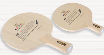
NO.28 松木独板，厚度8.5mm 9mm 10mm三种结构 Material: Hinoki Thickness:8.5±0.2mm Weight:105±3gms