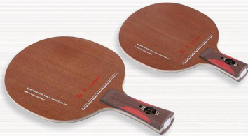
NO.154 沙比利木面材, 阿尤斯力材, 中间夹二层黑檀木, 桐木大芯 七层芳碳结构 Material: Surface:Pearl wood Force:Ayous Core:Candlenut Number of plywood:5 Thickness:6.0±0.2mm Weight: 85±3gms