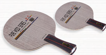
NO.62 咖啡色KOTO面材, 黑色碳夹阿尤斯大芯, 五木二碳 Material: Number of plywood:7 Surface:KOTO ( coffee ) Thickness:7.2±0.2mm Force:2 layers of black carbon Weight:89±3gms Core:Ayous