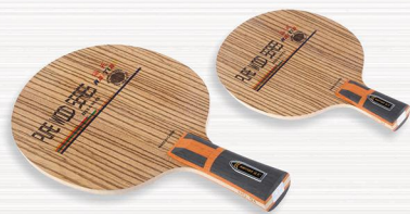
NO.94 面材斑乌木，力材阿尤斯，阿尤斯大芯 五层纯木板 Material: Surface: Zebra wood Force: Ayous Core:Ayous

Number of plywood:5 Thickness:5.6±0.2mm Weight:86±3gms