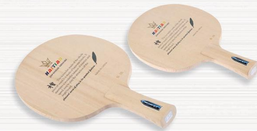
NO:176 日本桧木独板B级 Material: B level Japanese Hinoki Number of plywood:1 Thickness:8.5±0.2mm Weight:98±3gms