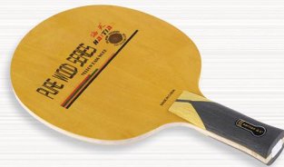
NO.88 面材染色淡黄榉木，力材榉木，桐木大芯五层纯木板 Material: Basewood Surface: Basewood Force: Basewood Core: Candlenut Number of plywood: 5 Thickness: 6.0±0.2mm Weight: 78±3gms