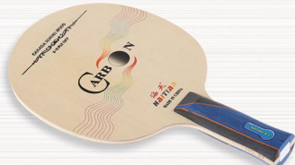
NO.87 面材桧木，夹二层软碳，阿尤斯大芯，三木二碳结构 Material: Hinoki Surface: Hinoki Force: 2 layers of soft wood Core: Ayous Number of plywood: 5 Thickness: 5.5±0.2mm Weight: 86±3gms