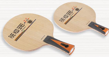
NO.92 面材阿尤斯，力材染色大红KOTO,阿尤斯大芯，五层纯木板 Material: Surface: Ayous Force: KOTO Core:Ayous

Number of plywood:5 Thickness:5.8±0.2mm Weight:75±3gms