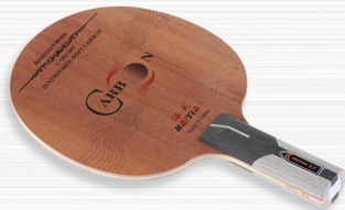
NO.82 桃花木面材，夹二层软碳，阿尤斯大芯，五木二碳结构 Material: Peach wood Surface: Peach wood Force: 2 layers of soft wood Core: Ayous Number of plywood: 7 Thickness: 6.0±0.2mm Weight: 86±3gms