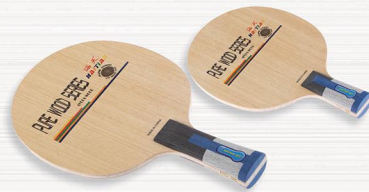
NO.95 面材阿尤斯，力材云杉，桐木大芯 五层纯木板 Material: Surface: Ayous Force: Spruce Core:Candlenut

Number of plywood:5 Thickness:6.0±0.2mm Weight:85±3gms