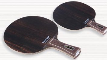
NO.21 黑檀面材, 中间三层阿尤斯夹两层黑檀, 七层纯木 Material: Surface:Ebenholz Number of plywood:7 Force:Ebenholz Thickness:6.2±0.2mm Core:Ayous Weight:90±3gms