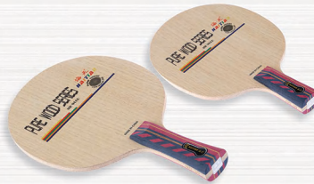
NO.39 白蜡木面材，云杉力材，阿尤斯大芯，五层纯木 Material: Ash Wood Surface: Ash Wood Force: Spruce Core: Ayous Number of plywood: 5 Thickness: 6.1±0.2mm Weight: 85±3gms