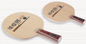
NO.1 阿尤斯面材，椴木力材，桐木大芯，五层纯木 Material: Number of plywood:5 Surface:Ayous Thickness:6.0±0.2mm Force:Basswood Weight:80±3gms Core:Candlenut