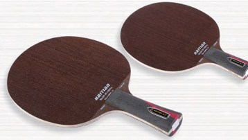
NO.103 面材鸡翅木,夹二层蓝黑芳基纤维,第三层阿尤斯,桐木大芯,五木二碳结构 Material: Surface:Wenge Wood mixed 2 layers of Carbon aramid Fiber Force: Ayous Core:Candlenut Number of plywood:7 Thickness:6.0±0.2mm Weight:85±3gms