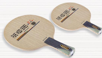
NO.22 林巴面材, 阿尤斯力材, 阿尤斯大芯, 五层纯木 Material: Surface:Limba Number of plywood:5 Force:Ayous Thickness:5.5±0.2mm Core:Ayous Weight:82±3gms