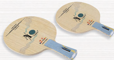
NO.164 林巴面板,阿尤斯力材,阿尤斯大芯,夹二层蓝黑芳纶纤维(缺角)靠面材 五木二碳 Material: Surface: Limba Number of plywood:7 Thickness:6.0±0.2mm Force: Ayous, blue and black Carbon Fiber Core: Ayous Weight: 90±3gms