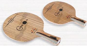
NO.101 面材斑马木,夹二层黑碳纤维,桐木大芯三木二碳结构 Material: Surface:Zebra Wood Force:2 layers of Carbon Core:Ayous Number of plywood:5 Thickness:6.5±0.2mm Weight:83±3gms