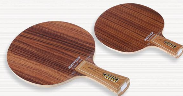
NO.32 玫瑰木面材，中间五层阿尤斯，七层纯木底板 Material: Rose wood Surface:Rose wood Force:Ayous Core:Ayous Number of plywood:7 Thickness:6.4±0.2mm Weight:87±3gms