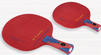
NO.162 阿尤斯面板(红色),阿尤斯力材(红色),阿尤斯大芯(红色) 五层纯木结构 Material: Surface:Ayous(Red) Number of plywood:5 Thickness:5.8±0.2mm Force: Ayous(Red) Core: Ayous(Red) Weight: 84±3gms