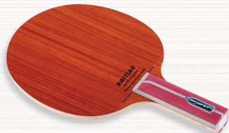
NO.85 红花梨面材，榆木力材，桐木大芯，五层纯木底板 Material: Safflower pear wood Surface: safflower pear wood Force: Hinoki Core: Candlenut Number of plywood: 5 Thickness: 6.2±0.2mm Weight: 93±3gms