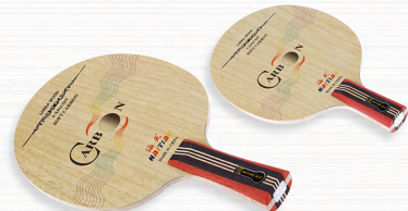
NO.61 林巴面材, 夹二层软碳, 桐木大芯, 五木二碳 Material: Number of plywood:7 Surface:Limba Thickness:5.9±0.2mm Force:2 layers of soft carbon Weight:80±3gms Core:Candlenut