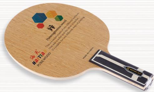
NO.81 一面黄铁刀，一面沙比利面材，五层纯木结构 Material: Sapele wood Surface: Lati+ sapele wood Force: Ayous Core: Ayous Number of plywood: 5 Thickness: 6.0±0.2mm Weight: 83±3gms