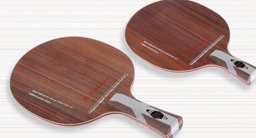
NO.159 玫瑰木面材, 阿尤斯力材, 中间夹二层黑榉木, 阿尤斯大芯 七层纯木结构 Material: Surface:Rose wood Force:Ayous, balck birch Core: Ayous Number of plywood:7 Thickness:5.7±0.2mm Weight: 83±3gms