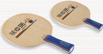
NO.2 林巴面材，三层阿尤斯芯板，五层纯木 Material: Number of plywood:5 Surface:limba Thickness:5.2±0.2mm Core: Ayous Weight:67±3gms