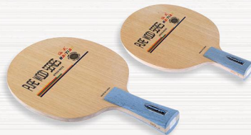
NO.3 阿尤斯面材，阿尤斯力材，加厚桐木大芯，五层纯木， Material: Number of plywood:5 Surface:Ayous Thickness:7.8±0.2mm Force:Ayous Weight:83±3gms Core: Candlenut