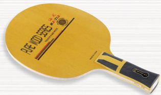
NO.89 面材染色淡黄椴木，力材椴木，桐木大芯 五层纯木板 Material: Surface:Basewood Force:Basewood Core:Candlenut

Number of plywood:5 Thickness:6.0±0.2mm Weight:78±3gms