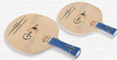
NO.100 面材白蜡木,力材阿尤斯,中间夹二层软碳,桐木大芯,五木二碳结构 Material: Surface: ASH Wood Force: Ayous + 2 layers of Soft carbon Core:Candlenut Number of plywood:7 Thickness:6.2±0.2mm Weight:83±3gms