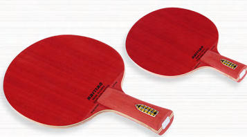
NO.60 大红KOTO面材, 中间四层阿尤斯, 一层KOTO, 七层纯木 Material: Number of plywood:7 Surface:Red KOTO Thickness:6.1±0.2mm Force:Ayous Weight:85±3gms Core:KOTO