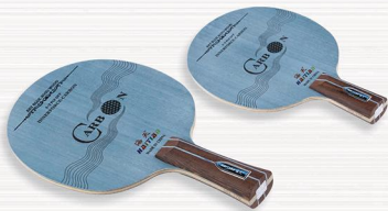
NO170 染色天蓝色KOTO, 阿尤斯力材, 阿尤斯大芯, 二层碳纤维靠大芯两侧 五木二碳 Material: Surface: KOTO(blue) Force: Ayous, Carbon Fiber Core: Ayous Number of plywood:7 Thickness:5.7±0.2mm Weight:92±3gms