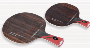
NO.157 黑檀木面材, 金黄黑芳碳纤维, 阿尤斯力材, 桐木大芯 七层芳碳结构 Material: Surface:Ebenholz Force:Ayous, Gold and balck Carbon Fiber Core: Candlenut Number of plywood:7 Thickness:5.8±0.2mm Weight: 85±3gms