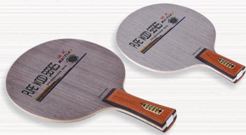
NO.17 咖啡色KOTO面材, 云杉力材, 阿尤斯大芯, 五层纯木 Material: Surface:KOTO Number of plywood:5 Force:Spruce Thickness:6.0±0.2mm Core:Ayous Weight:85±3gms