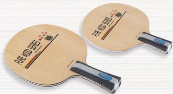
NO.91 面材阿尤斯，力材染色阿尤斯，桐木大芯 五层纯木板 Material: Surface: Ayous Force:Ayous Core:Candlenut

Number of plywood:5 Thickness:7.3±0.2mm Weight:90±3gms