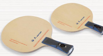
NO.156 松木面材, 云杉力材(黑色), 桐木大芯, 五层纯木结构 Material: Surface:Hinoki Force:Spruce wood (Black) Core: Candlenut Number of plywood:5 Thickness:6.0±0.2mm Weight: 84±3gms