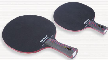
NO.26 硬碳高弹面材，九木八碳 Material: Hybrid wood Number of plywood:9+8carbon Thickness:6.1±0.2mm Weight:95±3gms