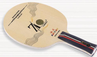
NO.90 面材椴木，黄黑芳基纤维，力材阿尤斯，桐木大芯 五木二碳结构 Material: Surface:Hinoki Force:Ayous+Carbon Aramid Fiber Core:Candlenut

Number of plywood:7 Thickness:7.0±0.2mm Weight:93±3gms