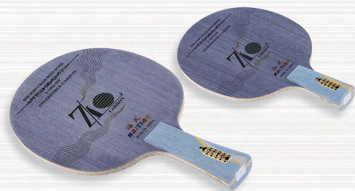
NO.165 林巴面板,阿尤斯力材,阿尤斯大芯,二层ZL黄黑芳纶纤维靠大芯两侧五木二碳 Material: Surface: Limba Number of plywood:7 Thickness:6.0±0.2mm Force: Ayous, yellow and black Carbon Fiber Core: Ayous Weight: 88±3gms