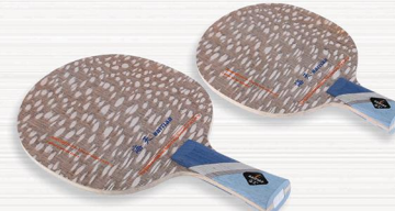
NO.151 珍珠木面材，阿尤斯力材，桐木大芯，五层纯木结构 Material: Surface:Pearl wood Force:Ayous Core:Candlenut Number of plywood:5 Thickness:6.0±0.2mm Weight: 85±3gms