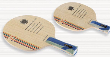
NO.4 林巴面材，中间五层不同厚度的阿尤斯，七层纯木 Material: Number of plywood:7 Surface:Limba Thickness:6.5±0.2mm Force:Ayous Weight: 85±3gms Core:Ayous