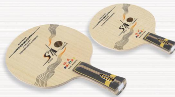
NO:174 KOTO面材, 阿尤斯力材, 桐木大芯, 二层日本进口S-ZLC芳纶纤维靠面材 五木二碳 Material: Surface: KOTO Force: Ayous, S-ZLC Carbon fiber Core: Candlenut Number of plywood:7 Thickness:5.7±0.2mm Weight:88±3gms