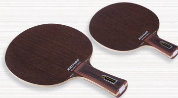
NO.38 鸡翅木面材，中间五层阿尤斯，七层纯木 Material: Wenge Wood Surface: Wenge Wood Force: Ayous Core: Ayous Number of plywood: 7 Thickness: 6.2±0.2mm Weight: 84±3gms