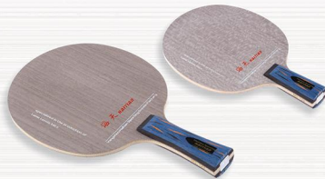
NO.122 染色KOTO面材，云杉力材，阿尤斯大芯，五层纯木 Material: Surface: KOTO Force:Spruce Core:Ayous Number of plywood:5 Thickness:6.0±0.2mm Weight:84±3gms