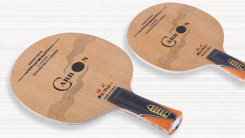
NO.104 面材樱桃木,力材阿尤斯,中间夹两层碳纤维 Material: Surface:Cherry Wood Force: Ayous + 2 layers of Carbon Core:Candlenut Number of plywood:7 Thickness:6.2±0.2mm Weight:92±3gms