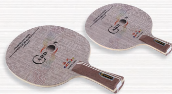
No.166 染色咖啡KOTO,阿尤斯力材,阿尤斯大芯,二层软碳靠面材五木二碳 Material: Surface: KOTO(coffee) Number of plywood:7 Thickness:6.0±0.2mm Force: Ayous, 2 layers soft carbon Core: Ayous Weight: 86±3gms