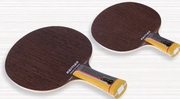
NO.37 鸡翅木面材，云杉力材，阿尤斯大芯，五层纯木 Material: Wenge Wood Surface: Wenge Wood Force: Spruce Core: Ayous Number of plywood: 5 Thickness: 6.0±0.2mm Weight: 85±3gms