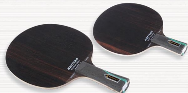
NO.96 面材黑椴木，力材椴木，中间夹二层黄黑芳基纤维，桐木大芯，五木二碳结构 Material: Surface: Ebenholz Force: Hinoki+ 2 layers of Carbon Aramid Fiber Core:Candlenut

Number of plywood:7 Thickness:5.7±0.2mm Weight:86±3gms