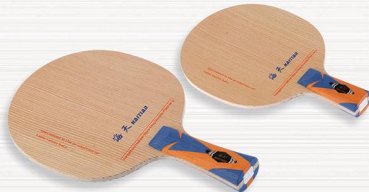
NO.148 云杉面材，黄黑碳纤维，阿尤斯力材，桐木大芯七层芳碳结构 Material: Surface:Spruce wood Force:Ayous Core:Candlenut Number of plywood:7 Thickness:6.0±0.2mm Weight: 85±3gms