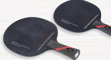
NO.160 阿尤斯面材(黑色), 黑色碳纤维, 阿尤斯大芯(黑色) 五层芳碳结构 Material: Surface:Ayous(black) Force: balck carbon fiber Core: Ayous (black) Number of plywood:5 Thickness:5.7±0.2mm Weight: 85±3gms