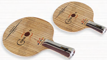
NO.57 面材斑马木, 夹高性能红黑芳纶碳纤维, 桐木大芯, 五木二碳 Material: Number of plywood:7 Surface:Zebra Wood Thickness:5.9±0.2mm Force:2 layers of red and black Weight:80±3gms carbon Core:Candlenut