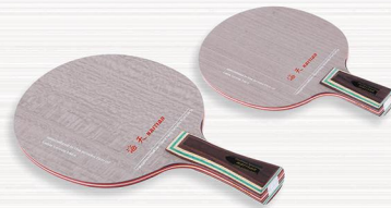
NO.125 染色KOTO面材，阿尤斯力材，七层木材，夹六层纳米碳粉。 七木六碳结构。 Material: Surface:KOTO mixed 6 layers of Nano carbon Force:Ayous Core:Ayous Number of plywood:13 Thickness:6.2±0.2mm Weight:90±3gms