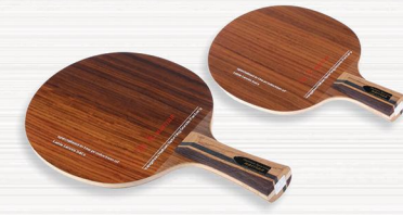
NO.128 玫瑰木面材，云杉力材，阿尤斯大芯，五层纯木 Material: Surface:Rosewood Force:Spruce Core:Ayous Number of plywood:5 Thickness:6.0±0.2mm Weight:85±3gms