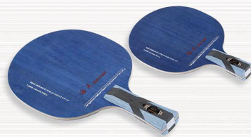
NO.158 阿尤斯面材(天蓝), 阿尤斯力材, 中间夹二层黑榉木, 阿尤斯大芯 七层纯木结构 Material: Surface:Ayous(blue) Force:Ayous, balck birch Core: Ayous Number of plywood:7 Thickness:5.7±0.2mm Weight: 83±3gms