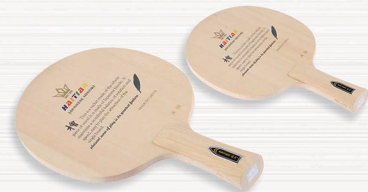
NO:175 日本桧木独板A级 Material: A level Japanese Hinoki Number of plywood:1 Thickness:8.5±0.2mm Weight:98±3gms