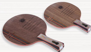
NO.20 黑胡桃面材, 中间夹两层大红阿尤斯, 七层纯木 Material: Surface:Walnut Number of plywood:7 Force:Ayous Thickness:6.3±0.2mm Core:Ayous Weight:83±3gms