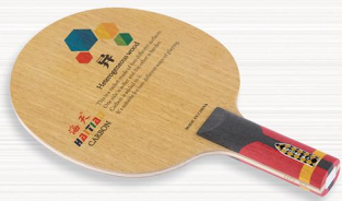
NO.84 一面黄云香，一面沙比利面材，夹二层软碳，阿尤斯大芯，五木二碳结构 Material: Movingui+ sapele wood Surface: movingui+ sapele wood Force: 2 layers of soft wood Core: Ayous Number of plywood: 7 Thickness: 6.1±0.2mm Weight: 93±3gms