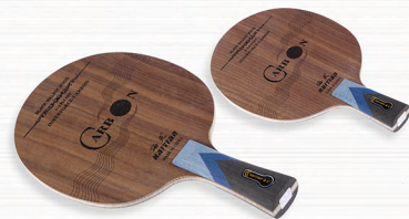
NO.64 黑胡桃面材, 云杉力材, 夹二层黑色碳纤维, 桐木大芯, 五木二碳 Material: Number of plywood:7 Surface:Walnut Thickness:6.4±0.2mm Force:Spruce, 2 layers Of black carbon Weight:95±3gms Core:Candlenut