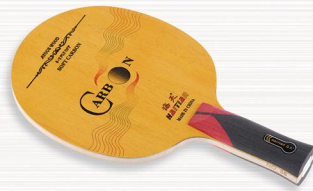
NO.86 面材染色淡黄阿尤斯，夹二层软碳，桐木大芯，五木二碳结构 Material: Ayous Surface: Ayous Force: 2 layers of soft wood Core: Candlenut Number of plywood: 7 Thickness: 7.2±0.2mm Weight: 87±3gms