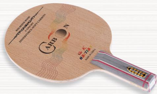
NO.83 面材红榉木，夹二层软碳，桐木大芯，五木二碳结构 Material: Red beech wood Surface: Red beech wood Force: 2 layers of soft wood Core: Candlenut Number of plywood: 7 Thickness: 6.5±0.2mm Weight: 100±3gms