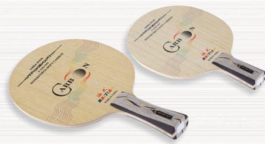
NO.24 林巴面材, 夹两层软碳, 阿尤斯大芯, 五木二碳 Material: Surface:Limba Number of plywood:7 Force:2 layers of soft carbon Thickness:5.8±0.2mm Core:Ayous Weight:83±3gms