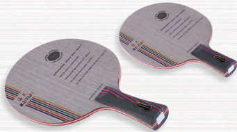
NO.34 咖啡色KOTO面材，二层碳，三层阿尤斯，七层碳素结构 Material: KOTO ( coffee ) Surface: KOTO ( coffee ) Force: carbon Core: Ayous Number of plywood: 7 Thickness: 6.3±0.2mm Weight: 90±3gms