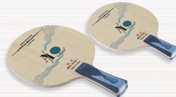
NO14 KOTO面材, 兰黑芳碳纤维, 阿尤斯力材, 桐木大芯, 七层芳碳结构 Material: Surface: KOTO Force: Ayous, blue and black Carbon Core: Candlenut Number of plywood: 7 Thickness: 5.5±0.2mm Weight: 85±3gms