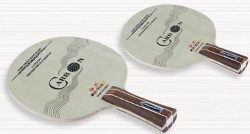
NO:169 染色绿色KOTO, 阿尤斯力材, 阿尤斯大芯, 二层金黄黑芳纶纤维靠大芯两侧 五木二碳 Material: Surface: KOTO(Green) Force: Ayous, Gold and black Carbon fiber Core: Ayous Number of plywood:7 Thickness:5.7±0.2mm Weight: 88±3gms