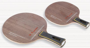
NO.121 黑胡桃木面材，云杉力材，阿尤斯大芯，五层纯木 Material: Surface:walnut Force:Spruce Core:Ayous Number of plywood:5 Thickness:6.0±0.2mm Weight:85±3gms