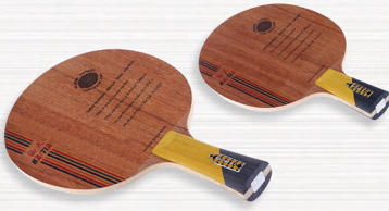
NO.36 红玫瑰面材，中间五层阿尤斯，七层纯木 Material: Red Rose wood Surface: Red Rose wood Force: Spruce Core: Ayous Number of plywood: 7 Thickness: 6.4±0.2mm Weight: 86±3gms