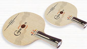
NO.58 面材白蜡木, 夹高性能红黑芳纶碳纤维, 桐木大芯, 五木二碳 Material: Number of plywood:7 Surface:Ash Wood Thickness:5.9±0.2mm Force:2 layers of red and black Weight:80±3gms carbon Core:Candlenut