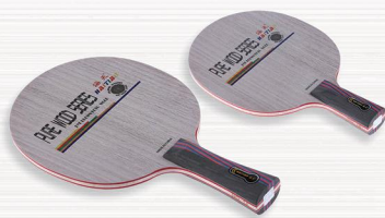
NO.18 咖啡色KOTO面材, 加厚阿尤斯力材, 阿尤斯大芯, 五层纯木 Material: Surface:KOTO Number of plywood:5 Force:Ayous Thickness:7.0±0.2mm Core:Ayous Weight:90±3gms