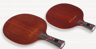
NO.152 红花梨木面材，阿尤斯力材，中间夹二层黑檀木，阿尤斯大芯七层纯木结构 Material: Surface:Safflower wood Force:Ayous Eberholz Core: Ayous Number of plywood:7 Thickness:5.8±0.2mm Weight: 83±3gms