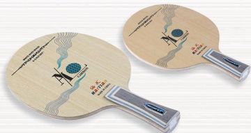
NO10 KOTO面材, 兰黑芳碳纤维, 桐木大芯, 阿尤斯力材, 七层芳碳结构 Material: Surface: KOTO Force: Ayous, blue and black Carbon Core: Candlenut Number of plywood: 7 Thickness: 5.7±0.2mm Weight: 85±3gms