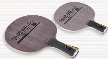
NO.27 咖啡色KOTO面材，云杉力材，阿尤斯大芯，五层纯木 Material: KOTO(coffee) Surface:KOTO(coffee) Force:Spruce Core:Ayous Number of plywood:5 Thickness:6.0±0.2mm Weight:84±3gms