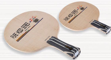
NO.29 枫木面材，云杉力材，阿尤斯大芯，五层纯木 Material: Maple wood Surface:Maple wood Force:Spruce Core:Ayous Number of plywood:5 Thickness:6.5±0.2mm Weight:86±3gms