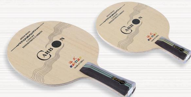
NO.8 阿尤斯面材，阿尤斯力材，高性能碳纤维，桐木大芯，七层碳板 Material: Number of plywood:7 Surface:Ayous Thickness: 6.4±0.2mm Force:Ayous + 2 layers of carbon Weight:90±3gms Core:Candlenut