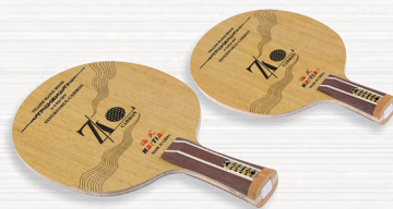
NO.167 黄云面板,阿尤斯力材,桐木大芯,二层ZLC灰黑芳纶纤维靠大芯两侧 五木二碳 Material: Surface: Dedaru Number of plywood:7 Thickness:6.5±0.2mm Force: Ayous, Grey and black Carbon fiber Core: Candlenut Weight: 88±3gms