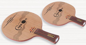
NO:172 樱桃木面材, 中间三层阿尤斯, 高性能碳纤维靠面材 五木二碳 Material: Surface: Cherry wood Force: Ayous, Carbon Fiber Core: Ayous Number of plywood:7 Thickness:6.2±0.2mm Weight:88±3gms