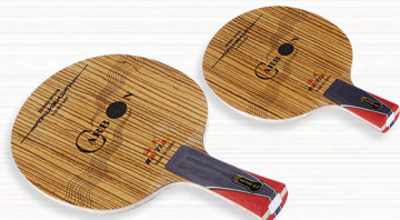
NO.63 斑马木面材, 高弹性碳纤维力材, 桐木大芯, 三木二碳 Material: Number of plywood:5 Surface:Zebra Wood Thickness:6.7±0.2mm Force:2 layers of Carbon Weight:85±3gms Core:Candlenut