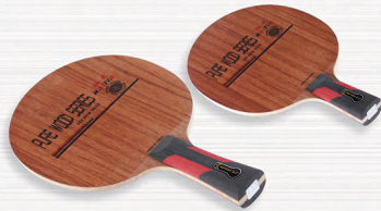
NO.35 红玫瑰面材，云杉力材，阿尤斯大芯，五层纯木 Material: Red Rose wood Surface: Red Rose wood Force: Spruce Core: Ayous Number of plywood: 5 Thickness: 6.0±0.2mm Weight: 83±3gms