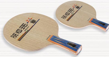
NO.5 林巴面材，云杉力材，阿尤斯大芯，五层纯木。 Material: Number of plywood:5 Surface:Limba Thickness:6.0±0.2mm Force:Spruce Weight:90±3gms Core:Ayous