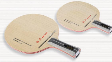
NO.127 林巴面材，中间五层阿尤斯，七层纯木 Material: Surface:Limba Force:Ayous Core:Ayous Number of plywood:7 Thickness:6.6±0.2mm Weight:88±3gms