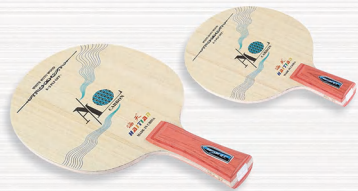
NO.97 面材KOTO,夹二层蓝黑芳基纤维,力材阿尤斯,桐木大芯,五木二碳结构 Material: Surface: KOTO mixed 2 layers Of Carbon Aramid Fiber Force: Ayous Core:Candlenut Number of plywood:7 Thickness:6.0±0.2mm Weight:85±3gms