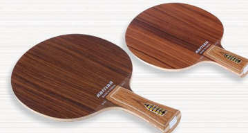
NO.31 玫瑰木面材，云杉力材，阿尤斯大芯，五层纯木 Material: Rose wood Surface:Rose wood Force:Spruce Core:Ayous Number of plywood:5 Thickness:6.0±0.2mm Weight:85±3gms