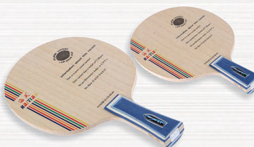
NO.40 白蜡木面材，加厚阿尤斯力材，顺丝云杉，七层纯木 Material: Ash Wood Surface: Ash Wood Force: Ayous + Spruce Core: Ayous Number of plywood: 7 Thickness: 6.7±0.2mm Weight: 95±3gms