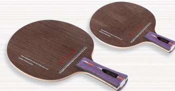
NO.126 鸡翅木面材，云杉力材，阿尤斯大芯，五层纯木 Material: Surface:wenge Wood Force:Spruce Core:Ayous Number of plywood:5 Thickness:6.0±0.2mm Weight:87±3gms