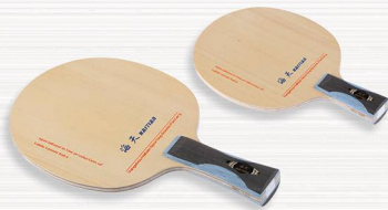
NO.146 日本栓木面材，黑色碳素，柳木大芯五层芳碳结构 Material: Surface:Japanese Hinoki Force: balck Carbon Fiber Core:Candlenut Number of plywood:5 Thickness:6.7±0.2mm Weight: 85±3gms