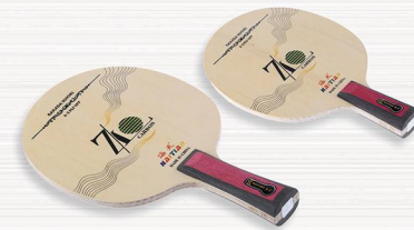
NO15 加厚桧木面材, ZL<柔雅>碳纤维力材, 桐木大芯 Material: Surface: Hinoki Force: ZL Carbon Core: Candlenut Number of plywood: 5 Thickness: 7.0±0.2mm Weight: 90±3gms