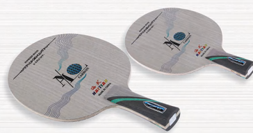
NO.168 染色柏桉木面板,阿尤斯力材,桐木大芯,二层ALC蓝黑芳纶纤维靠面材 五木二碳 Material: Surface: Phellem Number of plywood:7 Thickness:5.7±0.2mm Force: Ayous blue and black Carbon Fiber Core: Candlenut Weight: 88±3gms