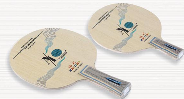
NO11 横拍KOTO面材, 兰黑芳碳纤维, 阿尤斯力材, 桐木大芯 直拍阿尤斯面材, 兰黑芳碳纤维, 阿尤斯力材, 桐木大芯 Material: Surface: KOTO Force: Ayous, blue and black Carbon Core: Candlenut Number of plywood: 7 Thickness: 6.0±0.2mm Weight: 86±3gms Material: Surface: Ayous Force: Ayous, blue and black Carbon Core: Candlenut

Number of plywood: 7 Thickness: 7.0±0.2mm Weight: 83±3gms