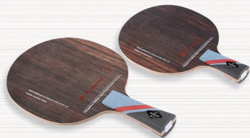
NO.155 黑榉木面材, 阿尤斯力材, 中间夹二层红花梨木, 阿尤斯大芯 七层纯木结构 Material: Surface:Ebenholz Force:Ayous, safflower wood Core:Ayous Number of plywood:7 Thickness:5.8±0.2mm Weight: 83±3gms