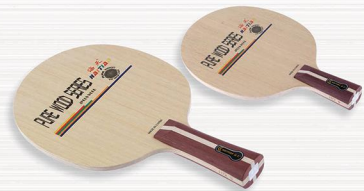
NO9 阿尤斯面材, 阿尤斯力材, 桐木大芯, 五层纯木 Material: Surface: Ayous Force: Ayous Core: Candlenut Number of plywood: 5 Thickness: 6.0±0.2mm Weight: 83±3gms