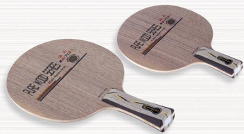
NO.25 黑胡桃面材，力材云杉，阿尤斯大芯，五层纯木 Material: Walnut Surface:Walnut Force:Spruce Core:Ayous Number of plywood:5 Thickness:6.0±0.2mm Weight:86±3gms