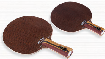
NO.59 鸡翅木面材, 夹高性能红黑芳纶碳纤维, 桐木大芯, 五木二碳 Material: Number of plywood:7 Surface:Wenge Wood Thickness:5.9±0.2mm Force:2 layers of red and black Weight:80±3gms carbon Core:Candlenut