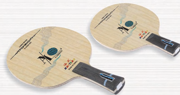
NO.163 林巴面板,阿尤斯力材,桐木大芯,夹二层ALC蓝黑芳纶纤维靠面材 五木二碳 Material: Surface: Limba Number of plywood:7 Thickness:6.0±0.2mm Force: Ayous, blue and black Carbon Fiber Core: Candlenut Weight: 85±3gms